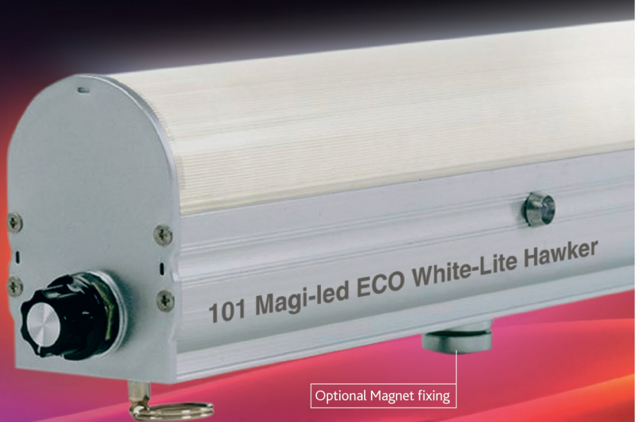
Optional Magnet fixing